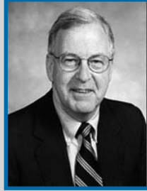
Senator Kemp Hannon