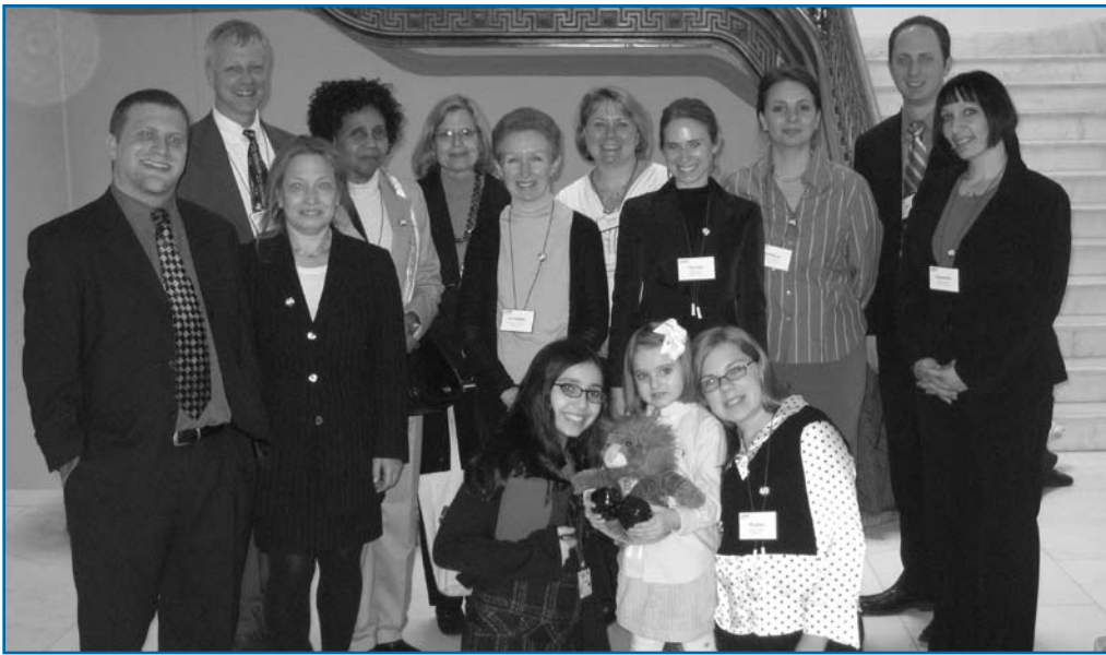
New York delegates to the 2007 Advocacy Summit take a break from their visits on Capitol Hill.